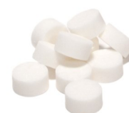
Benzoic acid 1g tablets