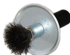
E2474 Cleaning brush