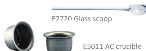
F2720 Glass scoop